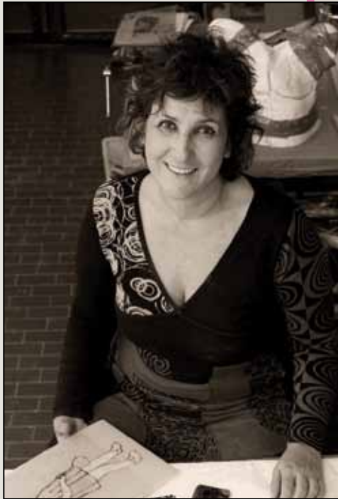
The artist in her studio.