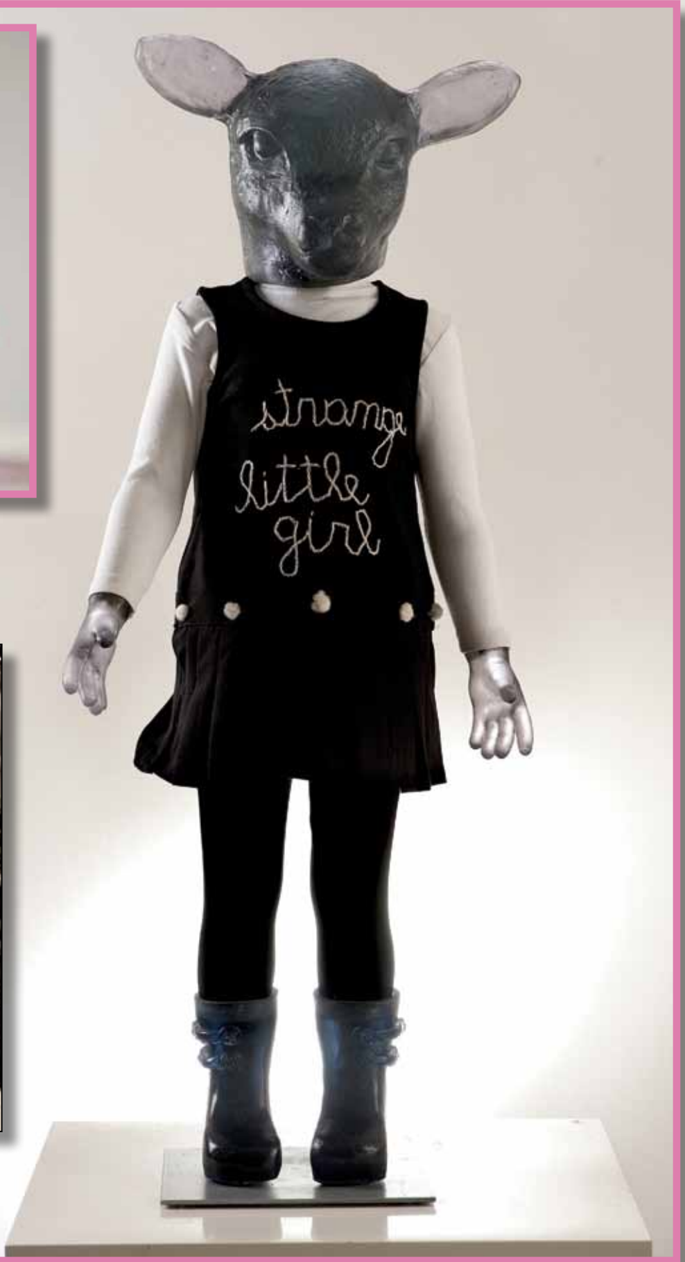
Silvia Levenson, Strange Little Girl #4 (Baby Sheep), kiln cast glass, mixed media, 41.75" x 17" x 10.75", 2011.