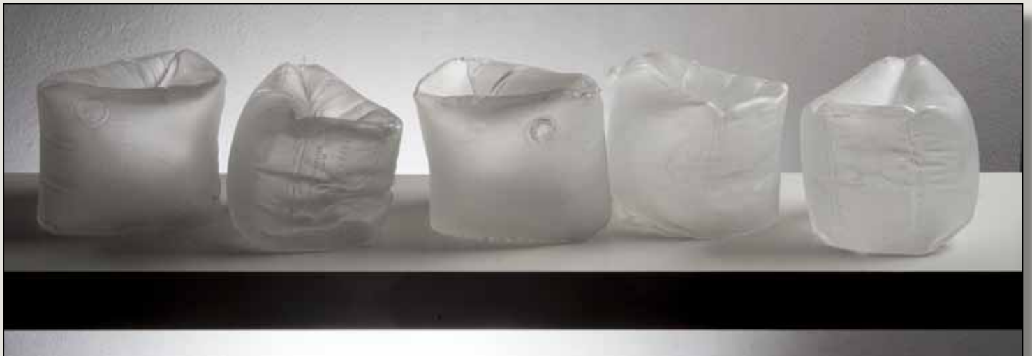
Silvia Levenson, Welcome to Europe , blown glass, 25 cm x 100 cm x 25 cm, 2015.

Human rights activists began standing in fierce opposition to these actions by the junta very early on. Notably, in 1977 the Grandmothers of the Plaza de Mayo was formed by grandmothers whose grandchildren had disappeared. By 2016, this group had identified 119 of the estimated 500 children who were stolen as babies.