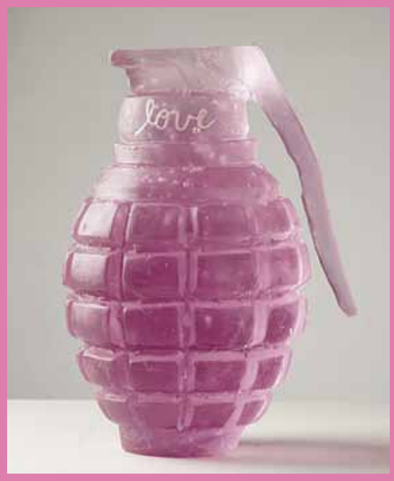
Silvia Levenson, 13 lb of love, kiln formed glass, 12" x 8" x 6", 2014.