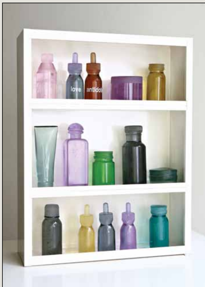
Silvia Levenson, The Pursuit of Happiness , kiln cast glass and metal, 17.75" x 13.75" x 4.375" installed, 2009.

Art often foreshadows the future, and Levenson's work as early as 2001 presaged the waves of refugees that currently flood into Europe from Africa. "I am making new pieces that address what is happening right now, as well as using old pieces connected to this theme."